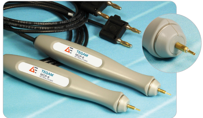
MCP-6 Probe Set with Coaxial Pins Installed

Compatible with TEGAM R1L-B, R1L-BR, R1L-BR1, R1L-D1