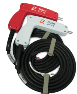
HTP-100 Pistol Grip Probes

Compatible with TEGAM R1L-B, R1L-BR, R1L-BR1, R1L-D1