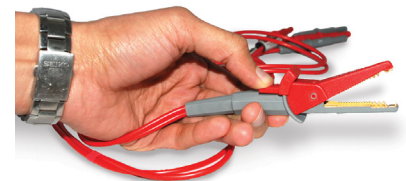
KAK-1M Kelvin Alligator Set

Compatible with TEGAM R1L-B, R1L-BR, R1L-BR1, R1L-D1