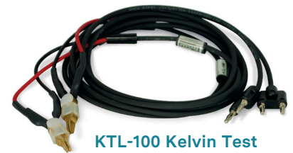
KTL-100 Kelvin Test Lead Set

Compatible with TEGAM R1L-B, R1L-BR, R1L-BR1, R1L-D1