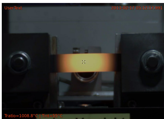
Example video image

InfraWin is easy-to-use measurement and evaluation software for remote configuration of stationary, digital IMPAC brand pyrometers.