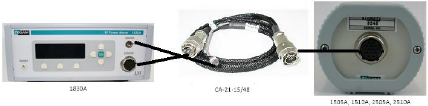
Figure 3 - Connection between 1830A and a heater/bias Combination Connector

The connection in Figure 3 is between an 1830A and a sensor with a combined heater and bias interface. Sensors with this configuration include Models 1505A, 1510A, 2505A, and 2510A. For this configuration the required interface cable is CA-21-15/48 (15" or 48").