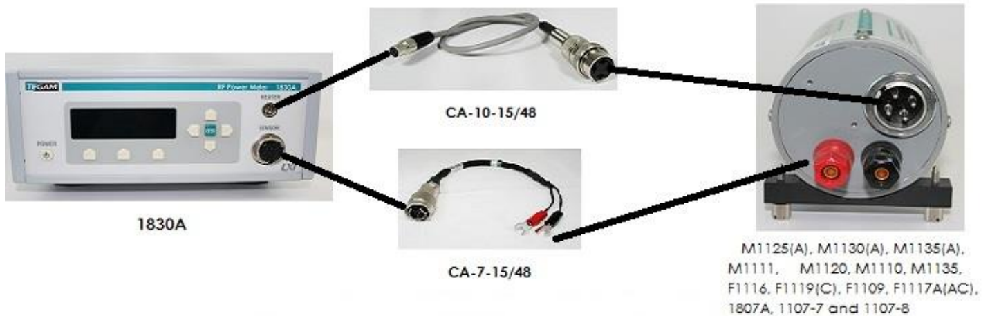
Figure 1 - Connection between 1830A and Large Heater Connector

The connection in Figure 1 is between an 1830A and a sensor with a "large" heater connector and separate binding posts for the bias voltage. Sensors with this configuration include the Model M1125(A), M1130(A), M1135(A), M1111, M1120, M1110, M1135, F1116, F1119(C), F1109, F1117A(AC), 1807A, 1107-7, and 1107-8. The required interface cables are Model CA-10-15/48 (15" or 48") and CA-7-15/48 (15" or 48").