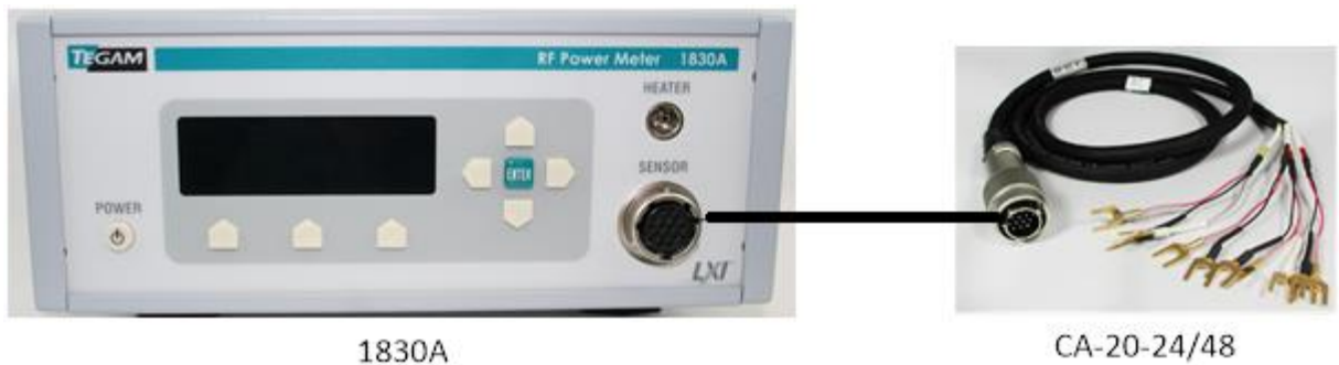
Figure 4 - Connection between 1830A and Calibration Equipment

The cable illustrated in Figure 4, CA-20-24/48 (24" or 48"), is used to interface the 1830A to an acceptable multi-function calibrator and other calibration standards for the purpose of calibrating the 1830A.