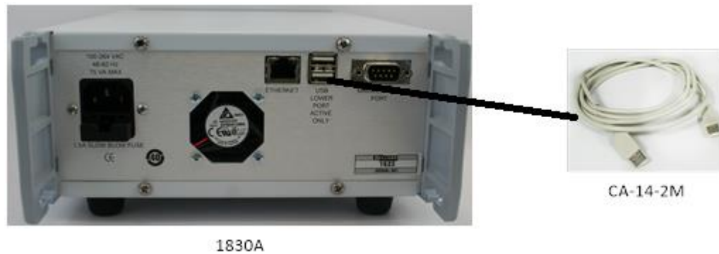
Figure 6 – Connection between 1830A and Controller

The connection in Figure 6 is between an 1830A and a controller, such as a laptop. The required USB interface cable is CA-14-2M.